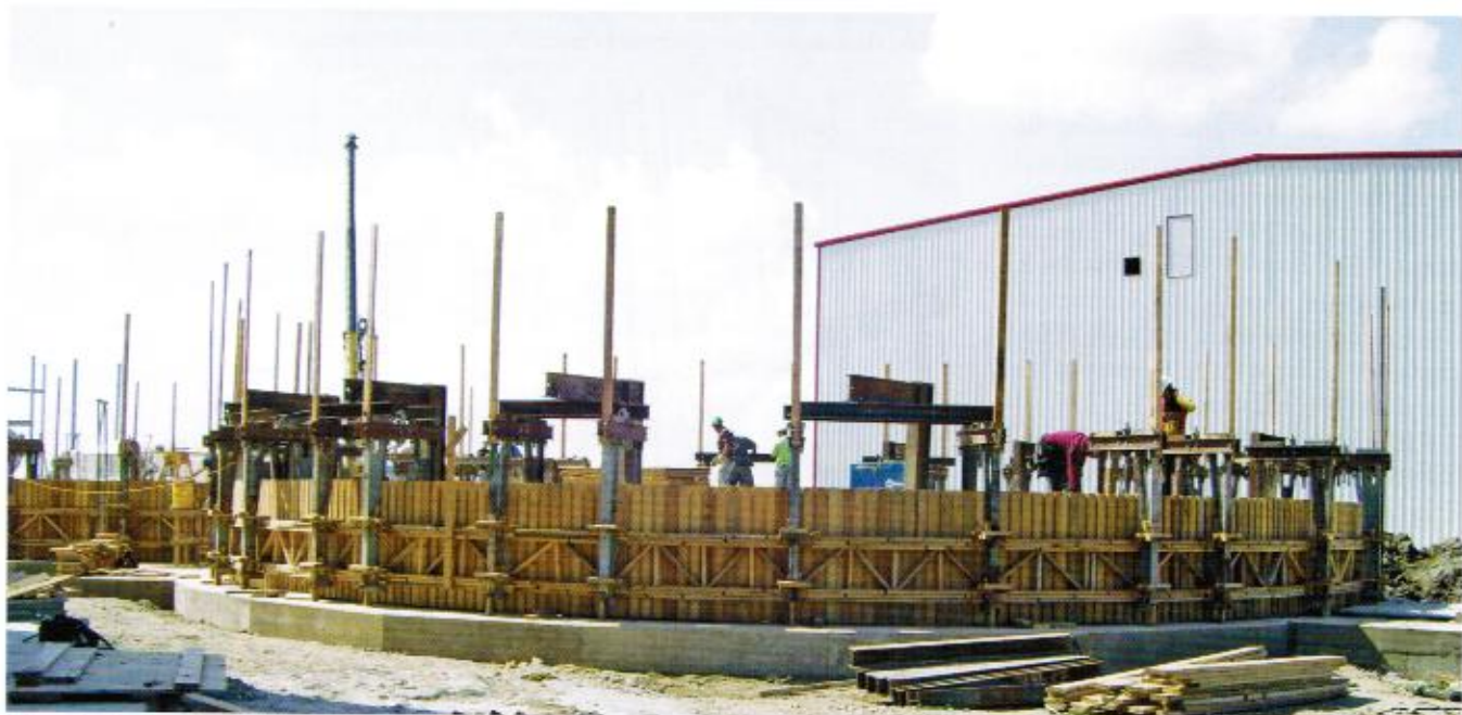
Shown is the form being constructed on top of the slab at ground zero. The concrete pump started from the bottom and never stopped until the silos were topped out.

The mix design varied based on the aggregate available in the area, but 4,000 psi strength was common for all five of the projects. The requirement of at least six bags of cement per yard and no fly ash reduced the friction on the constantly-moving forms. Because the five projects were accomplished over a 10-month span, retarders and accelerators were added, depending on outside temperature.