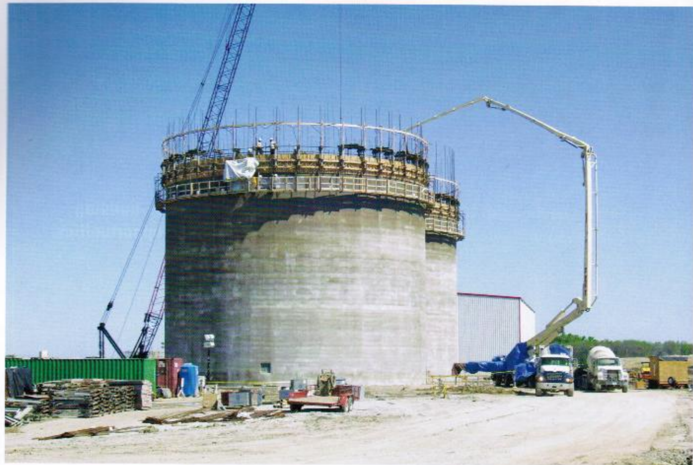
The boom design allowed the main section to be tilted back, allowing the operator to smoothly raise the boom with the climbing form.