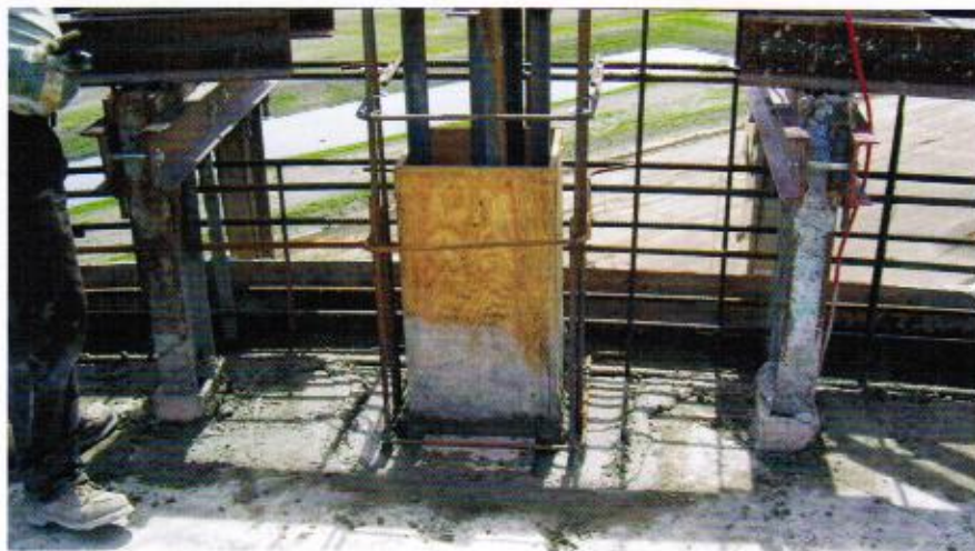
The concrete was deposited from the placer onto the floor of the climbing form. Laborers pushed the concrete into the form to maintain the correct volume.

And Hogenson has been impressed with the efficiency of the McCoy team. Thomas summed up the five projects: "A lot rides on the pumping for these projects. With so much at stake, the McCoy staff is always professional, competitive and good to work with." □