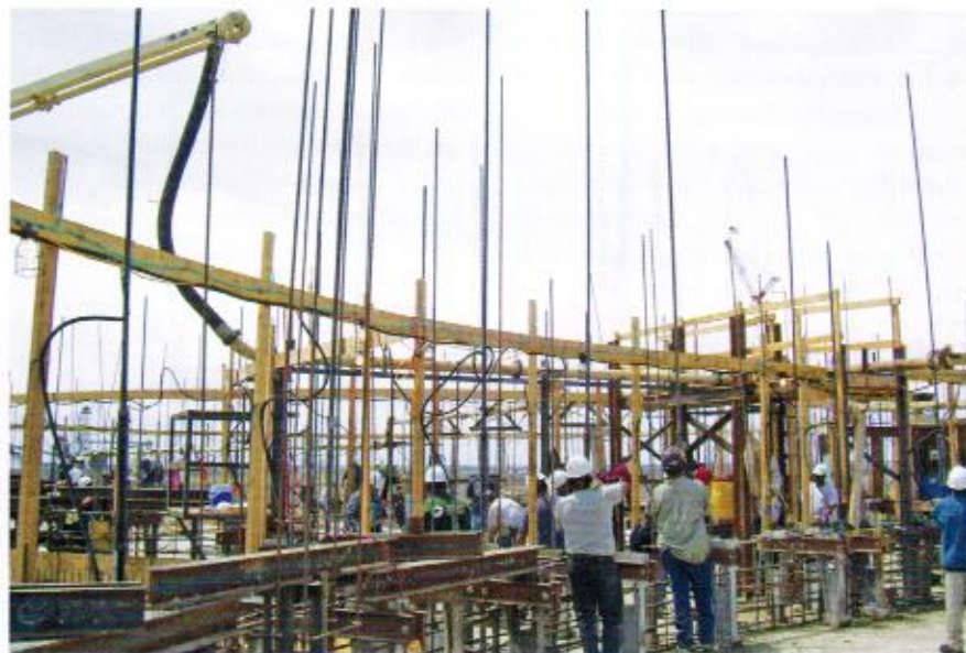
The 24-hour operation meant rebar was continuously tied on as the forms rose.