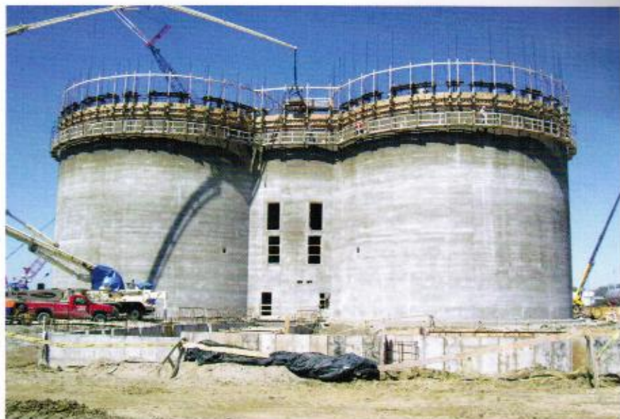
Twin 146-foot tall silos were slipformed continuously, with a core wall joining them together.

"We understood that keeping our crew comfortable would be important, considering the length of time they were on the job," Brown said, "so we built a camper on a Bobcat trailer and towed it to each site. As the jobs kept multiplying, we added a heater, then air conditioning; we waterproofed it and supplied them with a grill to cook on." Brown supervised the start of the job, but then three men—two operators and a mechanic—carried the load in twelve-hour shifts until the silo was complete.